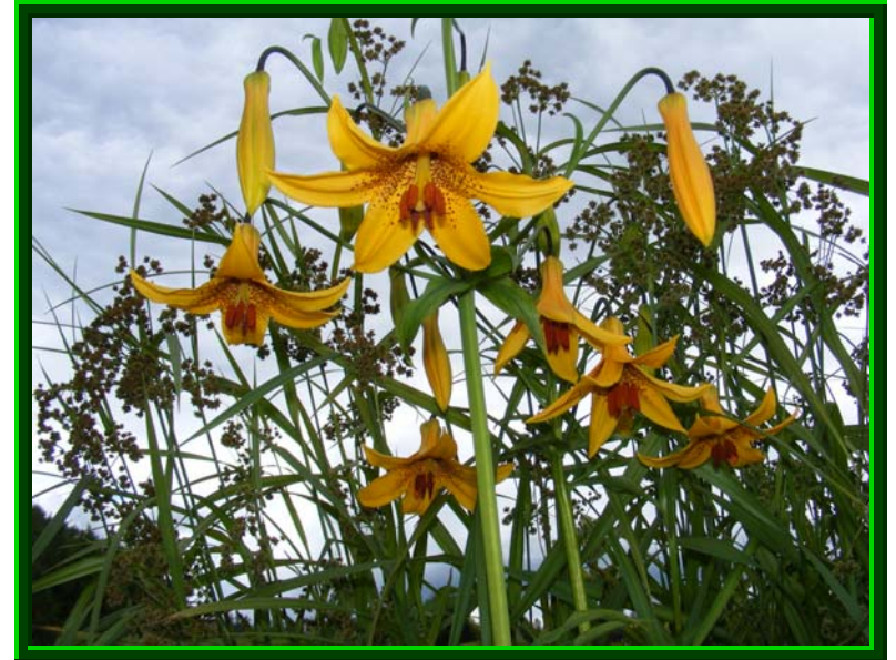
Lilium canadense (Canada Lily)